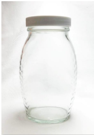
Queenline Style Jar