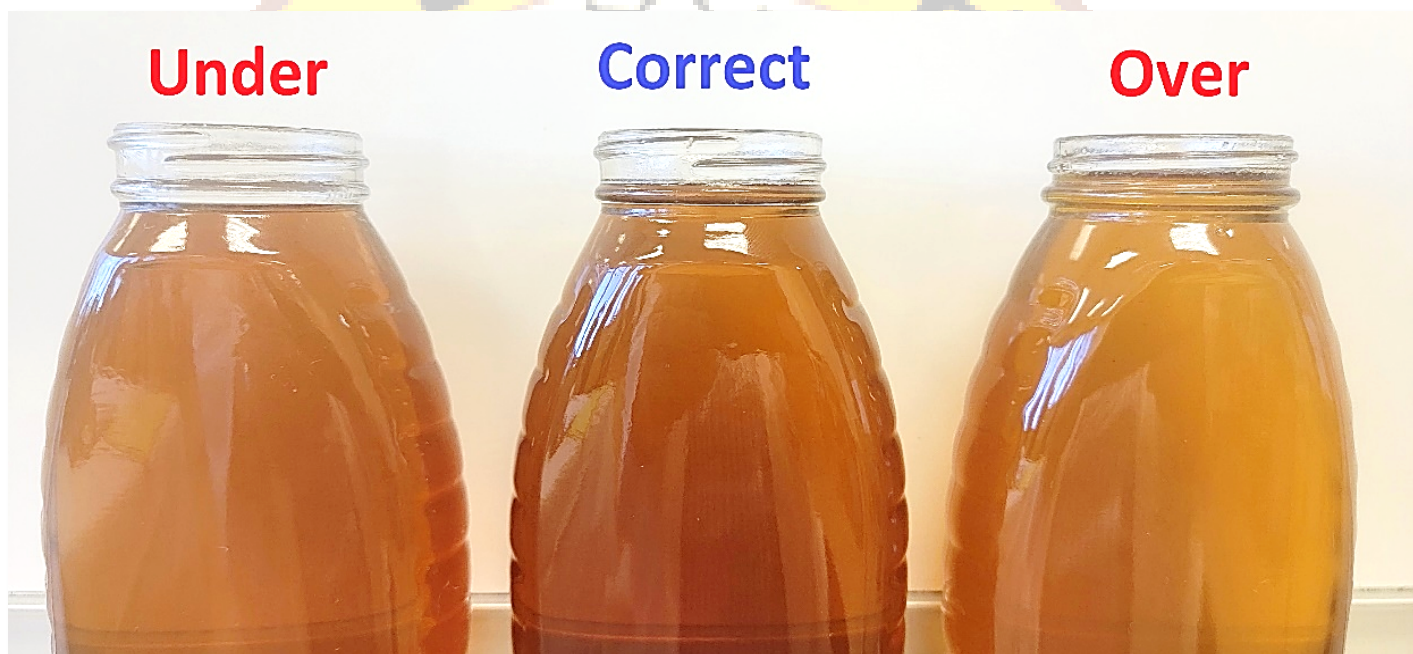
Queen line Style Jar